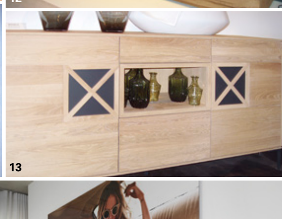
9|TV-screen as front: the LG television set is seamlessly integrated into the front. Photo: Interlücke 10+ 11| Emphasis on craftsmanship: Hartmann (11) and Wöstmann (10) are setting trends with crossgrained wood. Photos: Barth 12| Voglauer combines solid wood, coloured glass and metal. Photo: Barth 13+ 14| In Germany, wood tones are becoming lighter: white oiled oak from Team 7 (14) and Decker (13). Photos: Barth, Team 7